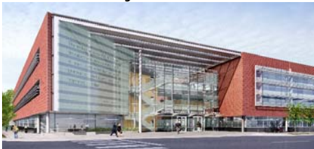
Client: Freeman White, Durham County GreenTech Services: Energy Modeling

Durham County Human Services: Anticipating LEED Gold